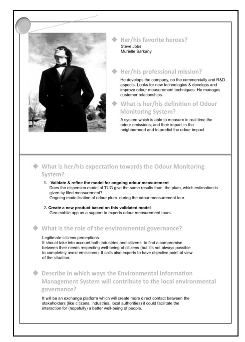
Figure 2: A Persona designed for the OMNISCIENTIS project (front and back)