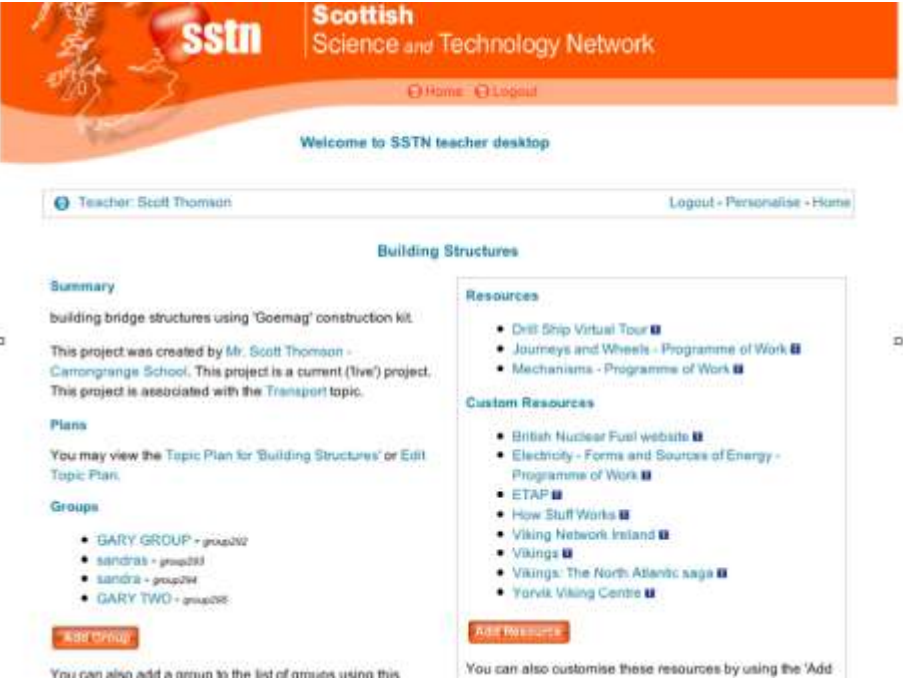
Figure 4: A sample teacher project screen

For example, in Figure 4 – A Sample Teacher Project Screen is shown that illustrates both summary of the group structure (full hierarchical information can also be displayed if required by the viewer), the groups associated with the group and the resources (both "standard" ones – suggested by SSTN – and the ones added in a customized why by the teacher). Notice the extensive use of automatically hypertext linking of all the elements of the system, which is key to making the system easy to use.