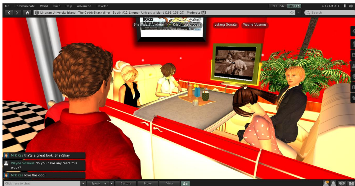
Figure 3: The vintage Philco TVs can display student-selected YouTube video clips which can be viewed by any avatars nearby. Cocktails can be served, and the avatars can simulate drinking the beverage of their choice!

protection from outside noise interference (music and other voice conversations), and privacy for those conversing inside. These booths are designed to support voice conversations using the VOIP technology built into SL, which works in a fashion similar to Skype.