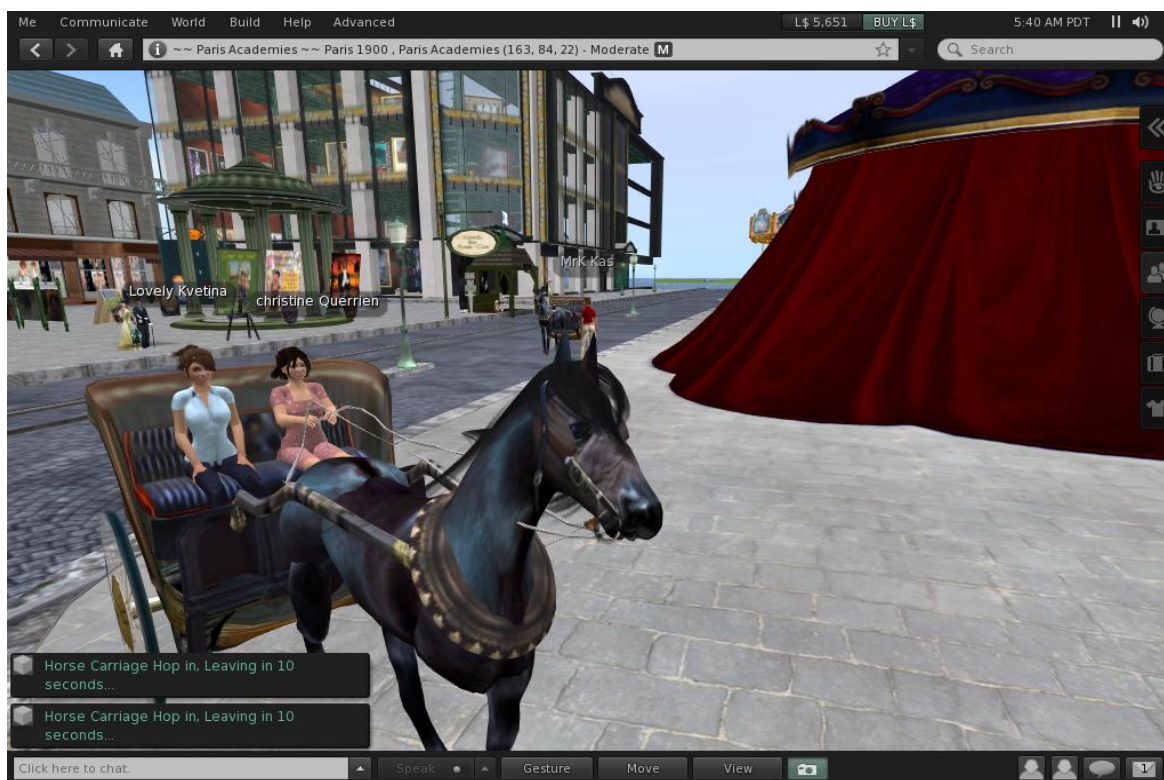
Figure 10: Here the students drive a horse-drawn carriage around the streets of Paris in 1900. Other favorite activities in this simulation were parachuting off the Eiffel tower and participating in the acrobatic circus!

During the workshops, the Global Classroom students expressed a high level of enjoyment using the virtual environment for their language-learning activities.