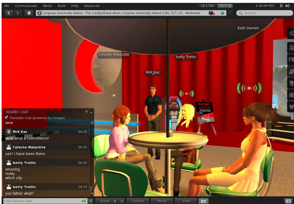
Figure 6: Hong Kong English 101 students using both audio (green arcs above the avatar indicate voice transmission) and chat in a discussion with US TESOL students