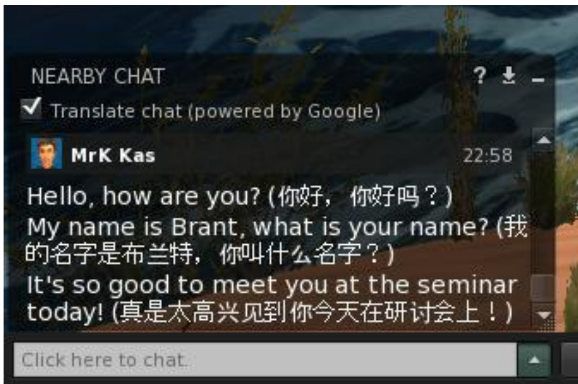
Figure 7: The new automatic machine translation of chat may prove to be a tremendous boon to language learners using the virtual environment

Other popular meeting areas included the campfires along the beach, and the rainforest simulation. The most popular non-language activities included dancing on the Caddy Shack rotating dance floor, riding the virtual horses in the meadows (Figure 8), and racing the virtual jet skis around the island