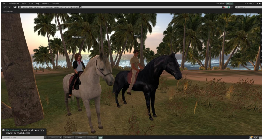
Figure 8: Riding horses is a popular activity on the Lingnan University Island in second life

perimeter. This rich environment offers a wide range of virtual activities to stimulate possible conversational scenarios between language learning partners.