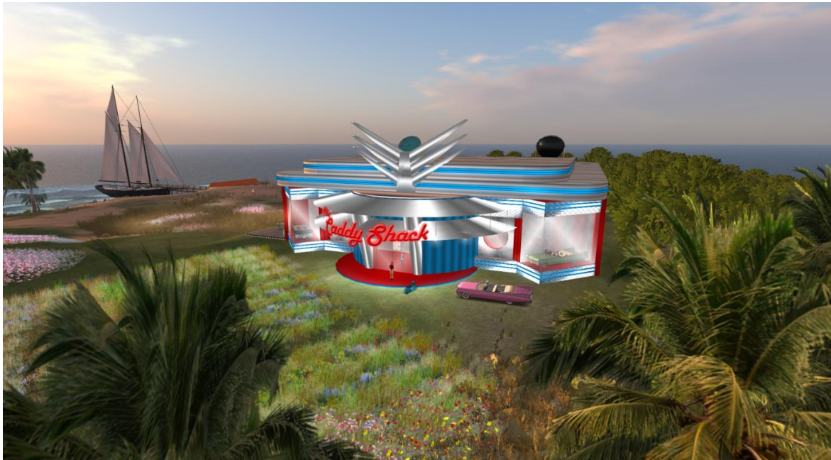
Figure 1: The Caddy Shack diner on Lingnan University Island in the second life virtual environment.