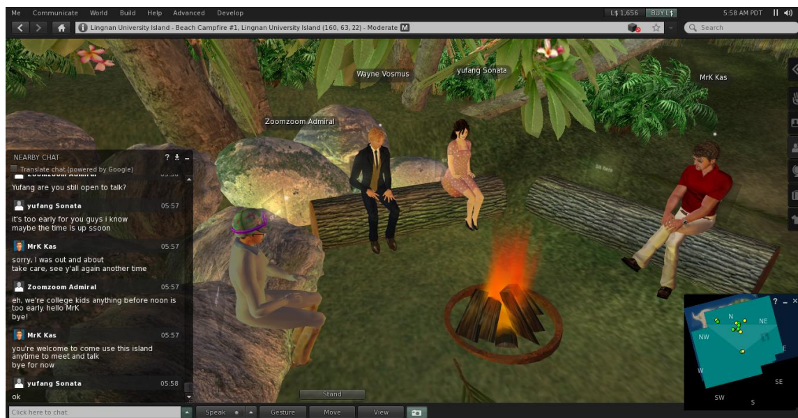
Figure 4: A beachside campfire gives students a quiet place for private chats

a free SL avatar account, students are trained in the basics of movement, navigation, interaction with the virtual environment, and communication. Students from TAMU also receive basic SL training from their instructor in Texas, and are given the link to the location of the Caddy Shack on Lingnan University Island within the SL virtual grid. Students are trained in the skills required to post documentation of their language-learning activities on discussion forums, including screen captures of encounters with their online language-learning partners and the resulting typed chat dialogue. This documentation is then available for final upload onto their e-portfolios for assessment of their Independent Learning activity by their CEAL tutors.