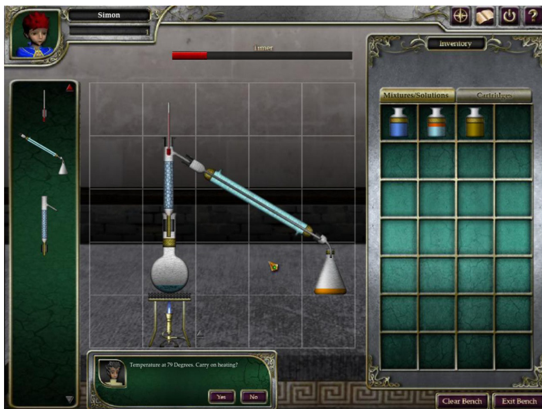
Figure 3: Players trying to separate a mixture comprising two liquids using fractional distillation in the virtual chemistry lab

As students participate in one level of the game-based curriculum after another, they enact a trajectory of learning chemistry by doing chemistry (albeit virtually). This trajectory instantiates the learning principle of competence-through-performance (Gee, 2007). The goal here is not merely to learn about chemistry, a third-person perspective on knowledge, but rather to learn chemistry as a performance capacity to engage in doing chemistry, a first-person perspective. This performance orientation entails not only physical behaviors related to doing but also speech acts and discursive moves appropriate to enacting professional practice. In this manner, students do not merely learn about chemistry. Rather, they learn to become chemists by imbibing the dispositions and values of professional chemists. In short, they develop their identity as chemists.