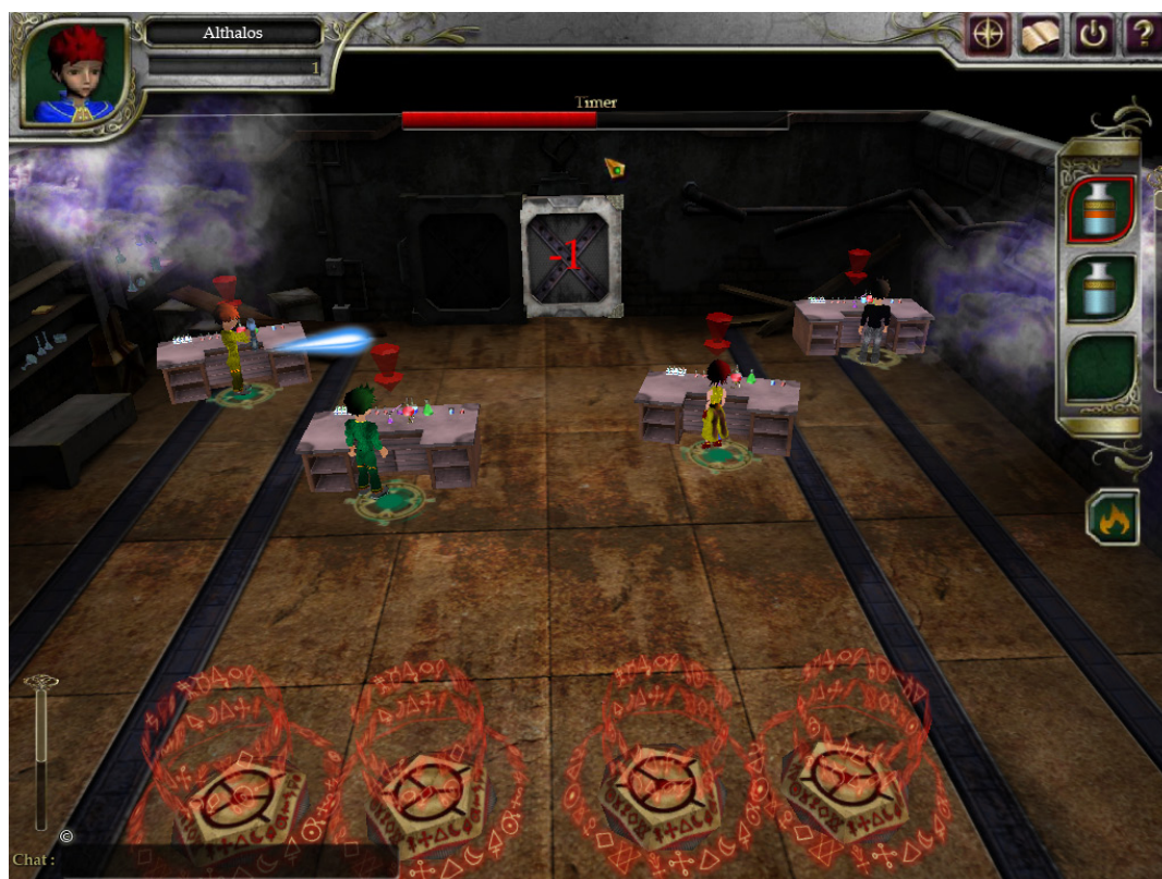
Figure 2: Players trapped in the underground chemistry lab

Teleporting to the virtual chemistry lab (see Figure 3), the players engage in carrying out separation techniques on their own. Figure 3 shows a player attempting fractional distillation with a mixture of immiscible liquids (indicated by the orange upper layer resting on the lower blue layer). Based on the game design, the simplest method of separating immiscible liquids is by using a separating funnel. The underlying pedagogy of game-based learning employed here, however, explicitly encourages students to experiment with multiple approaches to solving a problem so that they can derive a concrete sense of what works in relation to what does not work and, most importantly, to determine why. At times, there may be more than one functional solution. As curriculum designers, we want students to consider which solution should be regarded as the “better” solution and on what grounds.