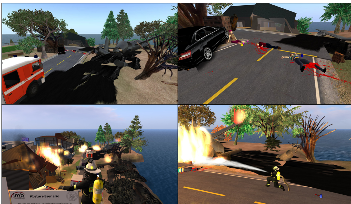
Figure 3: Emergency training in 3D

The project team tried to create just that. They built up a prototype of an online training site within Second Life, simulating a cargo plane crash over a suburban area on European University Island (see figure 3). There, the individual player has to manage multiple spreading fires and perform a triage following the Simple Triage and Rapid Treatment Scheme StaRT. Every crash victim has to be sorted into four different categories of injuries ranging from T3 (minor injuries) to T1 (major injuries) and TOT (fatal injuries or dead). The player has to decide quickly which individuals need to be taken care of immediately and which can wait until the severely injured have been treated? To guide the player in making the correct treatment decision, every injured person within the simulated disaster site has visible, more or less severe injuries and gives away a notecard. This notecard describes the individual’s injuries and afflictions. After making a decision, the player has to put up the appropriate triage sign and move on. The lack of immersive medical examination methods such as vitality checks is deliberate in order to allow for easy-to-use controls. These aspects are part of First Aid Training and First Care and should rather be practiced offline.