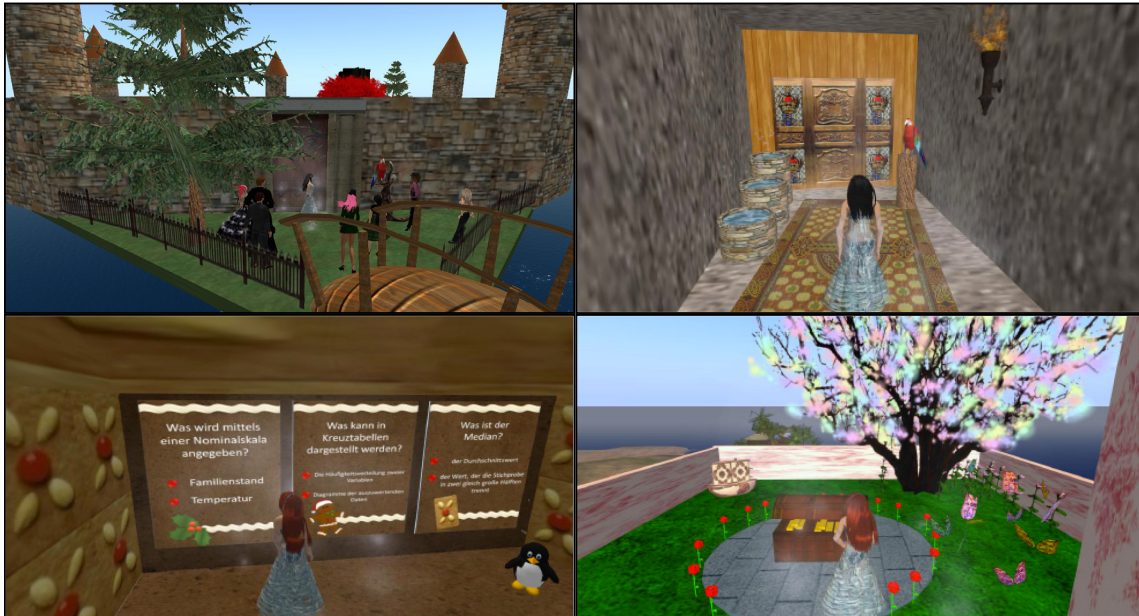
Figure 2: Learning adventure „Magic Forest“

like they have to learn the subjects rather than they want to learn them. For children, there is a wide range of learning games, many of which make learning a more attractive venture. However, for university students, there are only a very small number of similar products – there are far too many subjects and courses, differing from university to university, to allow the creation of economically interesting learning software.